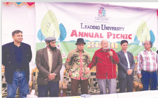
Leading University's Annual Picnic 2020 was held on 24 January at Rajnagar Tea Garden, Moulvibazar district in a grand and joyous atmosphere.