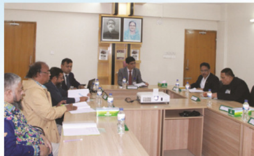
66th Syndicate Meeting held on 8 February 2020 in the Board Room of Leading University.