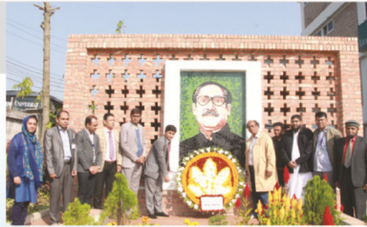
Leading University family laid a wreath at the Mural of Father of the Nation Bangabandhu Sheikh Mujibur Rahman at the University premises on Bangabandhu's Homecoming Day.