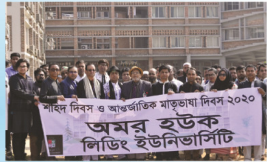
Leading University observed International Mother Language Day and Martyr Day on 21st February 2020. The activities of the day included a rally, placing flowers at the Shaheed Minar and a discussion on priding over one's own language.