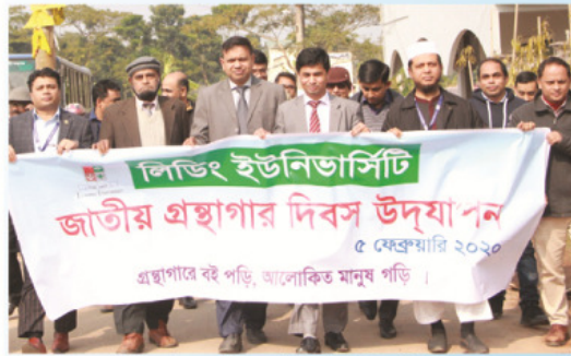
Leading University observed National Library Day on 5th February, 2020. On the occasion, a colorful procession was taken out from the university premises.