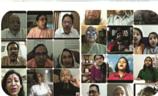
“Elo khushir Eid, Nazrul-er omar Geet”, a digital celebration of Eid-ul-Fitre and Birth Anniversary of Kazi Nazrul Islam held on 26 May 2020. Member of Board of Trustees, Syndicate Members, Teachers and Officers participated in the event.