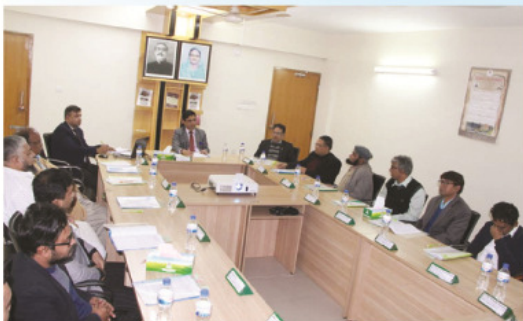
27th Academic Council Meeting held on 7 February 2020 in the Board Room of Leading University.